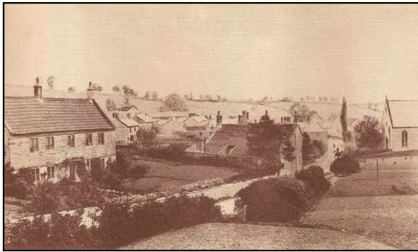
The Old Farm, Welton, seen on the left