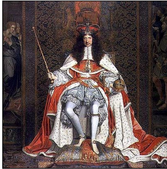
King Charles in his Coronation robes

Charles died on February 6th 1685, aged 54, and he was succeeded by his brother who became James II.